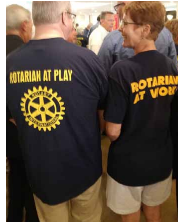
Random photos from last week to keep you mellow